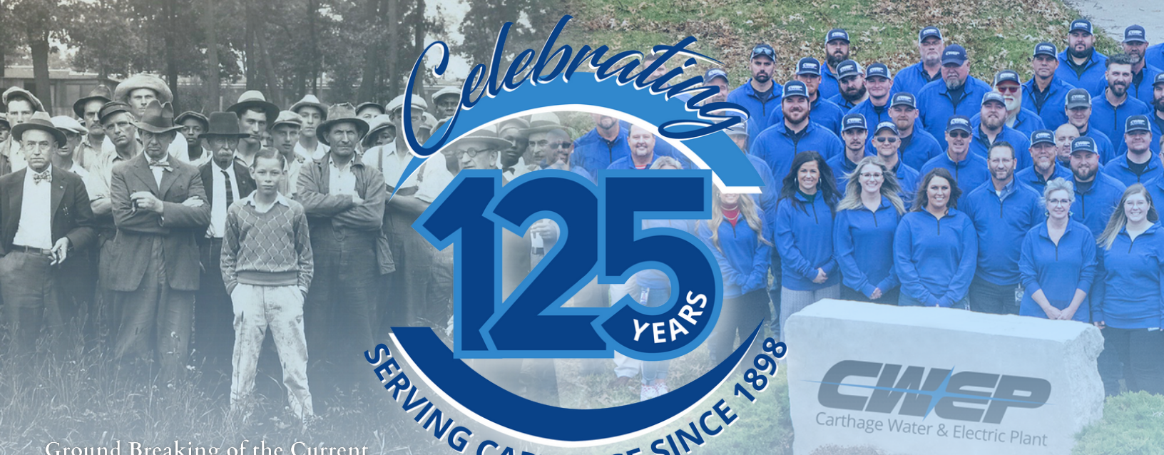
Ground Breaking of the Current CWEP Power Plant