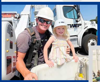
Transportation Day The Early Childhood

As your local municipally-owned utility provider, we focus on creating meaningful connections within our Carthage community. We're proud to sponsor local organizations and community events that benefit our neighbors, family, and friends. Serving our community is why we love what we do!