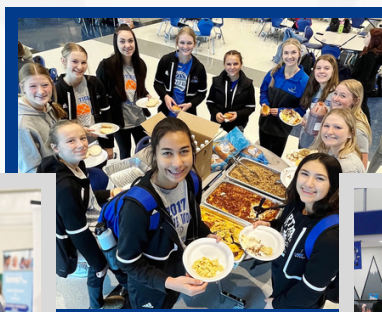
CHS Girls Basketball CWEP Sponsored Team Meal