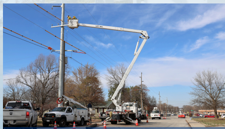
Construction of the new 69kV transmission line