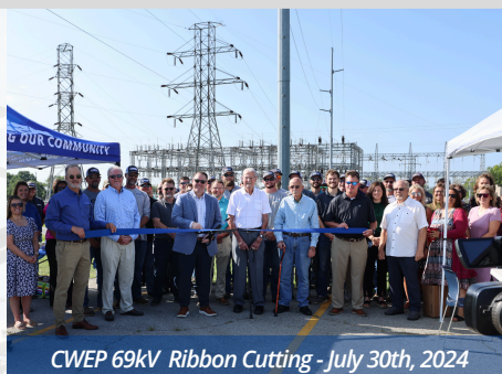
CWEP 69kV Ribbon Cutting - July 30th, 2024

CWEP is excited to announce we have completed the replacement of our 69kV transmission line, located on the East side of town, and have begun significant renovations to two of our CWEP substations. These important infrastructure projects play a vital role in ensuring the continued delivery of reliable and efficient power service to the Carthage community. By completing these necessary upgrades, we are able to strengthen our system's